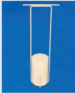
Molly Assay Canister