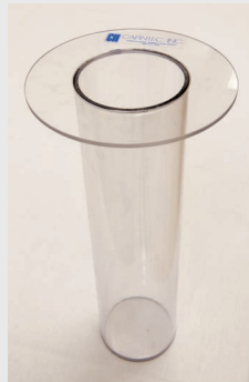
Chamber Well Insert