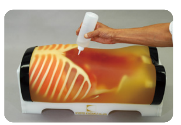
2. Spread ultrasound gel over the phantom body.